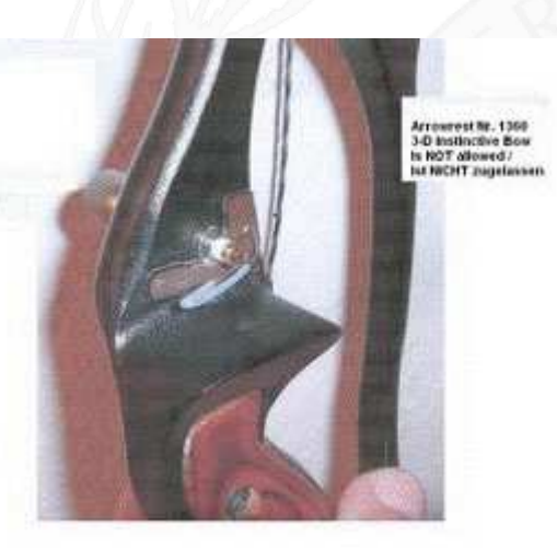
1360: not allowed